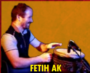
FETIH AK Percussion